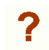
Others to come...